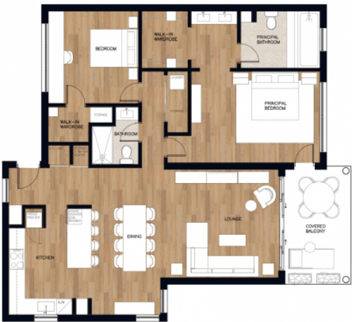
WATERWAYS #234 - FLOOR PLAN - NOT TO SCALE