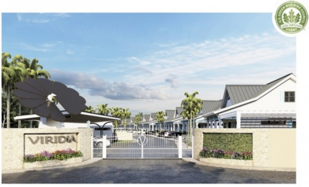
viridia | 3