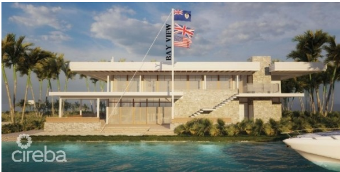
The Sports and Leisure Facilities Plan