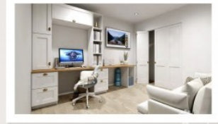
Open Plan Kitchen, Dining, Living Room & Den