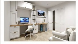
Open Plan Kitchen, Dining, Living Room & Den