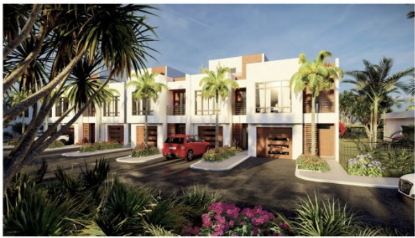
3 Buildings, 18 Townhomes