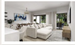
Open Plan Kitchen, Dining, Living Room & Den