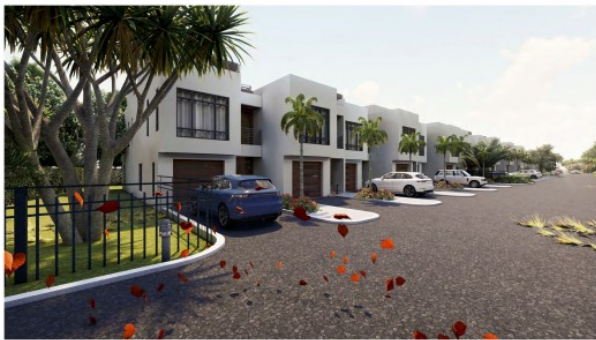
Your Quiet Suburban Oasis in The Shores