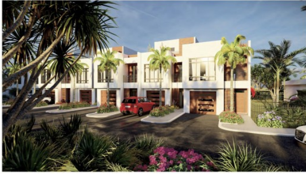
3 Buildings, 18 Townhomes