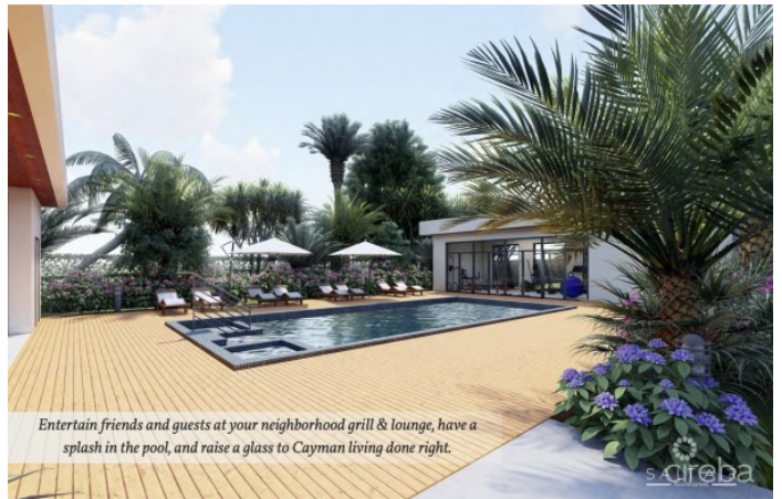
Entertain friends and guests at your neighborhood grill & lounge, have a splash in the pool, and raise a glass to Cayman living done right.