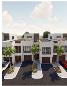
A Higher Quality of Living