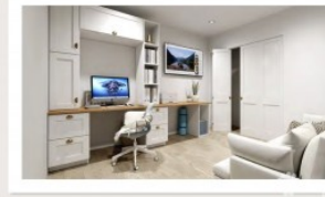
Open Plan Kitchen, Dining, Living Room & Den